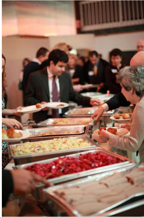
The buffet of food representing over 20 restaurants and 17 different cultures.

Red Queen Design Studio Key Bridges First Medical Care, Inc. The Little Wine Shop Piedmont Hospital