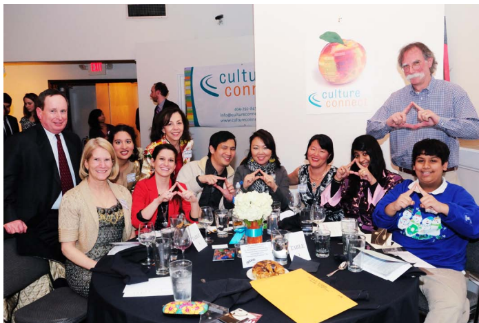
The winning trivia table.